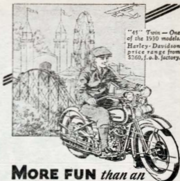
"45" Twin — One of the 1930 models. Harley-Davidson price range from $260, f.o.b. factory.

Send only $1.00 deposit with each tire ordered. Balance C.O.D. If you send cash in full, deduct 5%. You are guaranteed a year's service or replacement at half price. MILAND TIRE AND RUBBER COMPANY , Dept. 17A, 1000 West Sixty-third St., Chicago, Ill.